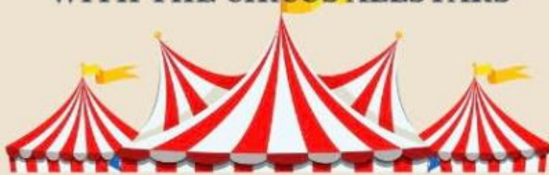
PLATE SPINNING TIGHT ROPE JUGGLING STILT WALKING & MORE CIRCUS SKILLS WITH THE CIRCUS ALLSTARS

COME ON DOWN TO THE BIG TOP BAR SERVING COCKTAILS, MOCKTAILS, BEER & FIZZ. SAMPLE A CANNONBALL BURGER FROM THE BBO DRIVE IN CINEMA SHOWING CIRCUS THEMED CLASSICS, BOTTLE TOMBOLA, GAMES, GLITTER TATTOOS POPCORN, PLUS CIRCUS SKILLS TO KEEP THE KIDS BUSY!